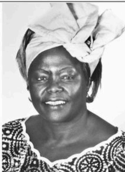
Wangari Muta Maathai The Nobel Peace Prize 2004