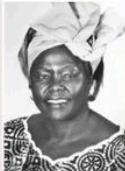
Wangari Muta Maathai The Nobel Peace Prize 2004