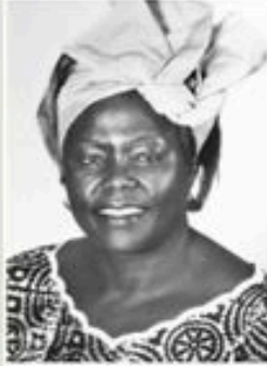
Wangari Muta Maathai The Nobel Peace Prize 2004