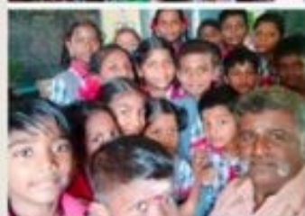
Panchayat Municipal Middle School, Surankottai colony, Ramanathapuram