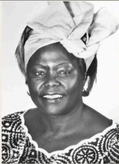
Wangari Muta Maathai The Nobel Peace Prize 2004